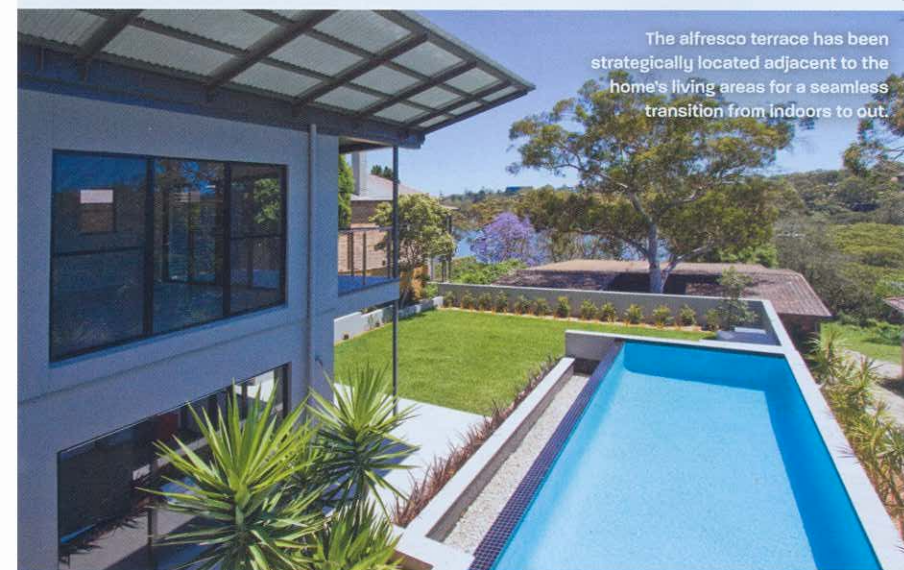
The alfresco terrace has been strategically located adjacent to the home's living areas for a seamless transition from indoors to out.

Taking an organic approach, The Ecologie Group builds homes with sustaining style